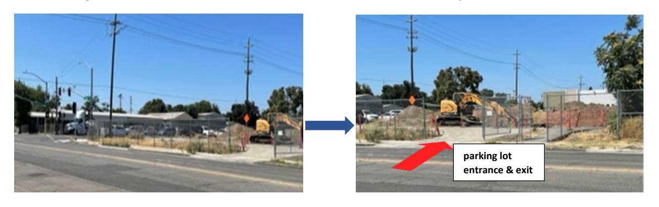
Street Parking on Hazelton Ave